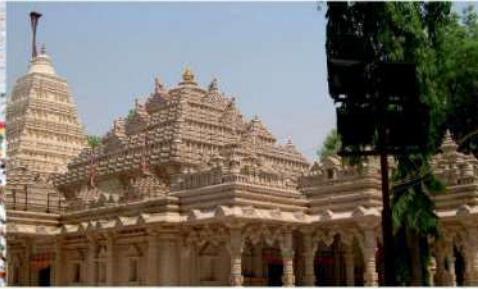
► Jain Temple