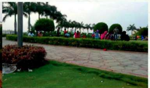
► Mini Tankbund

RAIGIRI, Mothkur Road, Yadadri Dist., TELAGANA - 508116.