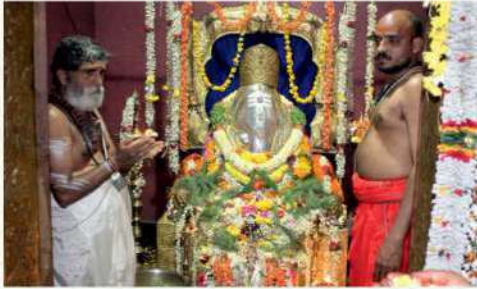
► Swetharka Ganapathi Temple