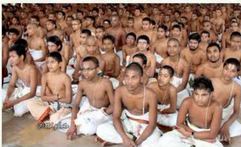
► Vedic School