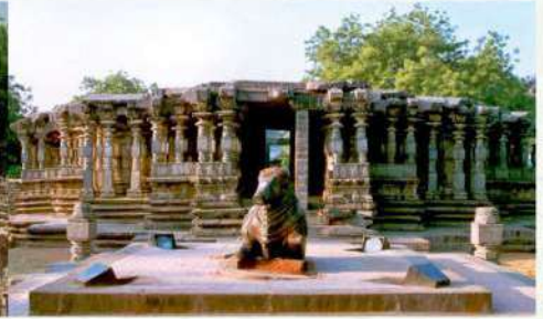
► 1000 Pillars Temple